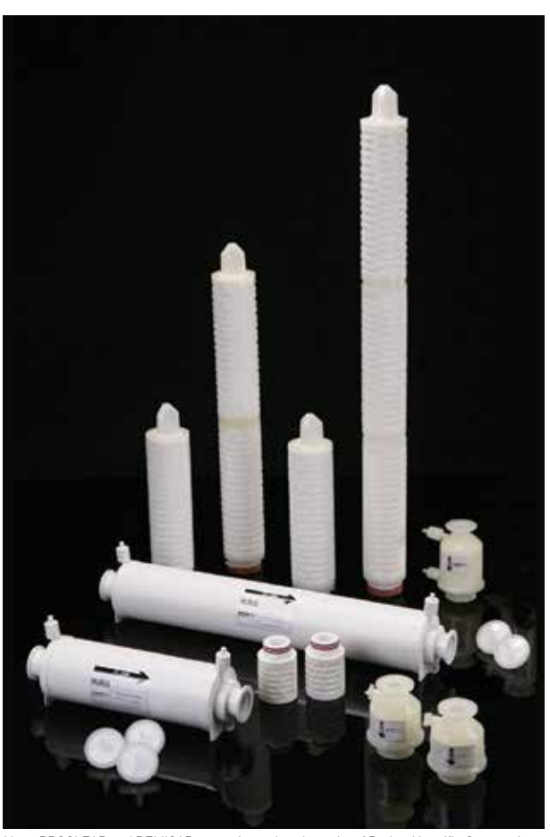
Note: PROCLEAR and DEMICAP are registered trademarks of Parker Hannifin Corporation.